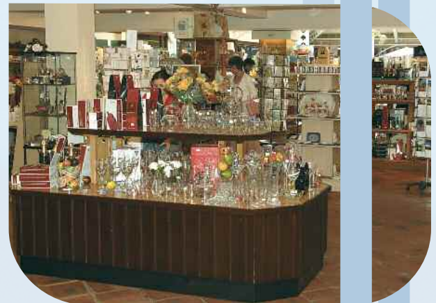
Protecting retail outlets

Due to the nature of our business, we are unable to publish a client list. Please contact us for further information and references.