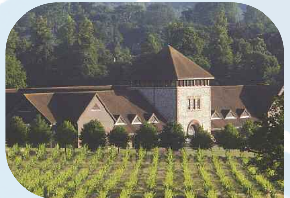
Protecting tourist centres